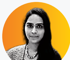
Roma Shaikh Podar International School Salary: ₹ 4.56 lakh/yr