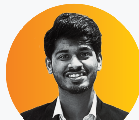
Smit Parekh Podar International School Salary: ₹ 4.56 lakh/yr