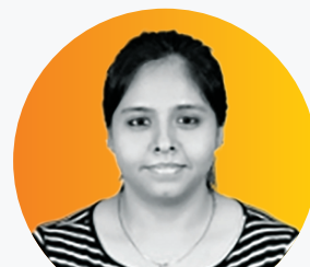
Vrushti Thakkar Podar International School Salary: ₹ 4.32 lakh/yr